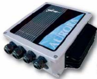
Wind Interface Box

Specifications Rated Output Power: 6kW at 11.5 m/s and above (measured after inverter) Cut-in wind speed: 2.7 m/s (6mph) Survival wind speed: 60 m/s (134 mph) Rotor diameter / Swept area: 18.4 ft / 265 ft 2 Blades: 2 fiberglass-epoxy blades, aluminum root inserts Power and overspeed regulation: full span, sealed centrifugal pitch control system Brake: tower base forced blade stall mechanism Rotation speed: 80-245 rpm Tip speed: 23-70 m/s (52mph -157mph) Alternator: 6.5kW direct-drive permanent magnet, 3-phase wild AC Weight: 450 lbs Horizontal thrust: 5500 Newton (1200 lbs) at 60m/s (134 mph) Maintenance: annual inspection Warranty: 5 years